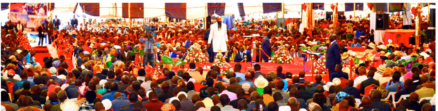
FIRST INTERNATIONAL CONFERENCE OF PASTORS / NAKURU KENYA - AUGUST 29-31, 2014