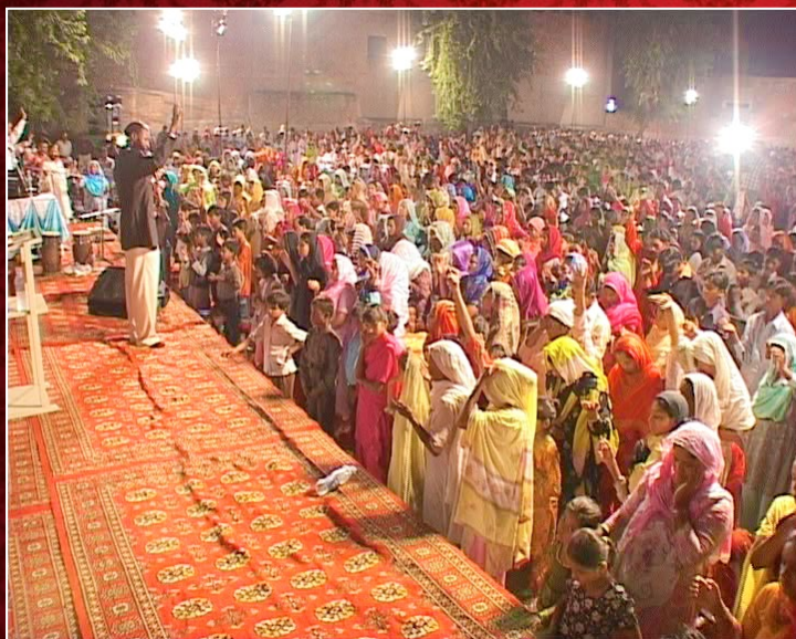
Many muslims received the LORD

nations inclusive, for the glorious coming of the Messiah. The central theme that this clock ministers unto the nations of the earth, is a dogma that underscores the need for the christian believers to begin the process of smearing the door frames of their Christians hearts with the perfect BLOOD of Jesus. In that way, this clock has become a heavenly host that points the nations to the Cross of Jesus, and a PREPARER of what is about to befall the earth. In so doing, this clock of GOD is vigorously drawing the attention of men to that genuine old biblical Calvary REPENTANCE of the BLOOD, and solemnly testifying concerning Jesus of Nazareth. It is a timely host that is boldly witnessing upon the coming of the glorious Kingdom of the Messiah, and the requirements on its citizenry . By warning the nations to prepare , this humongous golden clock in the sky, has become a faithful witness that is testifying a sombre caution on the coming judgment that will consume those who fail to heed its warning , and fall short of the benchmark for the midnight hour . This