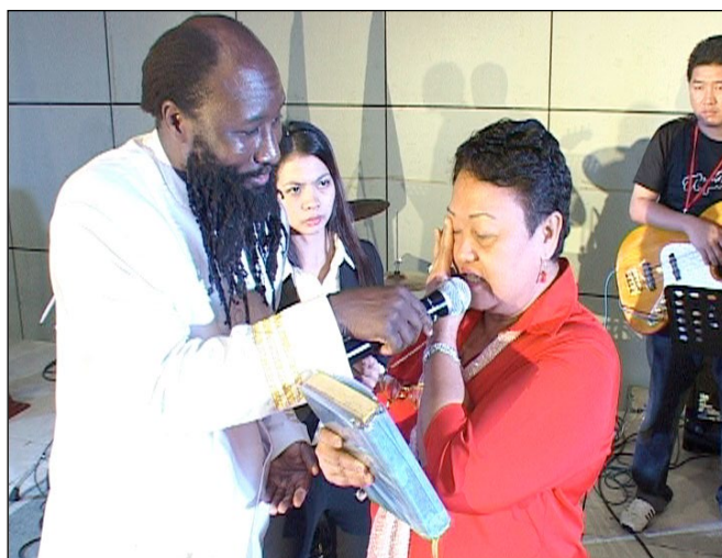
MANILA, PHILIPPINES PASTORS' CONFERENCE

Therefore, through this vision of the midnight clock and the centralization of the BLOOD of Jesus that it highlights, GOD ALMIGHTY is now reminding the church of how HE decided to pay a heavy price by releasing Jesus being both GOD and Man, to be HIS perfect Sacrifice. In this way, the 11:59pm clock of GOD was meant to stir up the fact that, Jesus gave HIMSELF to GOD THE FATHER as a ransom for humanity.