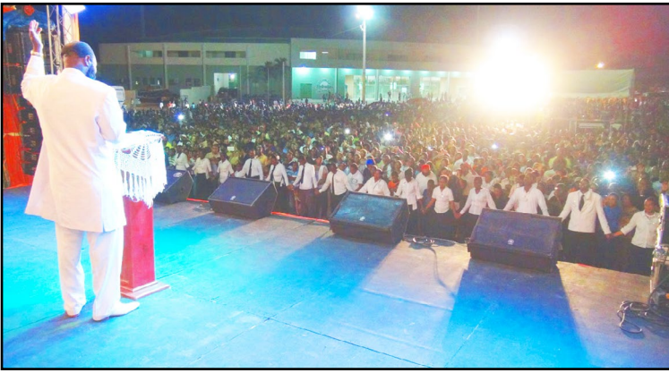
SAN PEDRO DE MACORIS, DOMINICAN REPUBLIC HEALING SERVICE 2013

today's modern church. In that way, this visitation is emphasizing the need for the present-day church of Christ to return to the original basics of the Calvary salvation . Thus, this midnight clock has brought back to the centre stage the need to shun today's horizontal gospel of prosperity , and to instead champion the atonement works that Christ earned for the church, at Calvary. It is a vision that is stressing the fact that, in all her weaknesses and sin, GOD ALMIGHTY has as a matter of fact not cast the church away as worthless , from HIS agenda! This vision of the midnight clock serves as a classic demonstration that the LORD still endeavours to embrace an awakening in the church. Because atonement for sin essentially describes how the human being can be reconciled with GOD, then, what this golden midnight clock is doing in the church at this hour, is indeed humongous . It