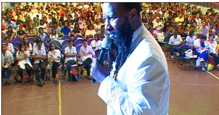
MANILA, PHILIPPINES HUGE PASTORS' CONFERENCE

defeating the captor. It is a sombre reminder of the high cost and price that Christ Jesus paid for the church's salvation. In this way, the LORD is using this vision to warn the present-day church that she cannot in any way continue abusing the grace owing to the high ransom paid.