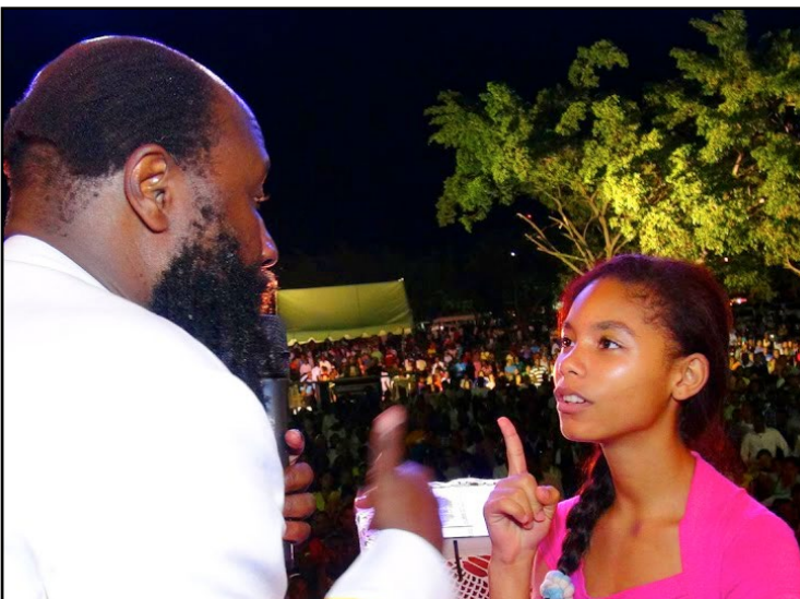
SAN PEDRO DE MACORIS, DOMINICAN REPUBLIC HEALING SERVICE 2013

Furthermore, this midnight clock is also meant to remind us of the ransom that Jesus of Nazareth paid to liberate mankind from the slavery of sin and satan. This is how Christ's own life was laid down by GOD THE FATHER as a ransom sacrifice for rescuing man. In so doing, this vision of the midnight clock has essentially reawakened the role of the victory that the LORD Jesus scored for us over satan, and that such a role consisted of swapping the life of the perfect Lamb of GOD for the lives of the imperfect men. In this case then, the Clock of GOD is reminding the church that Jesus Christ defeated satan in a bruising spiritual battle that freed the enslaved mankind thereby