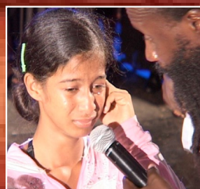
Totally Deaf Ears Pop Open