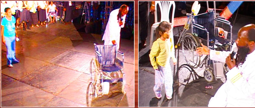
Many Cripples walked out of wheelchairs.

groups of virgins, wise and foolish, were distinguishable only so far as the jar of oil is concerned. It is this oil that separates GOD's elect from the worldly church. When the LORD hinted that only the wise virgins with oil would make it into the Kingdom of GOD, that became the most fearful prophecy. The reason the wise church enters the rapture is because of the jar of oil she beholds. And this jar of oil essentially represents the reservoir of the flow of the anointing of the Holy Spirit. This in other words becomes the most important indicator yet, that the vision of the midnight clock essentially alludes to the commencement of the dispensation of the Holy Spirit. The LORD is saying here that only the Holy Spirit has the mandate to prepare a glorious bride of Christ and present her on that day.