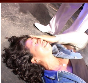
Blind Eye Healed Live On Camera